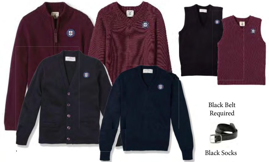
Burgundy or Navy Cardigan, Sweater, or Vest with Geneva Logo

Please read Section II in its entirety YOUNG MEN'S PROPER FIT FOR ATTIRE