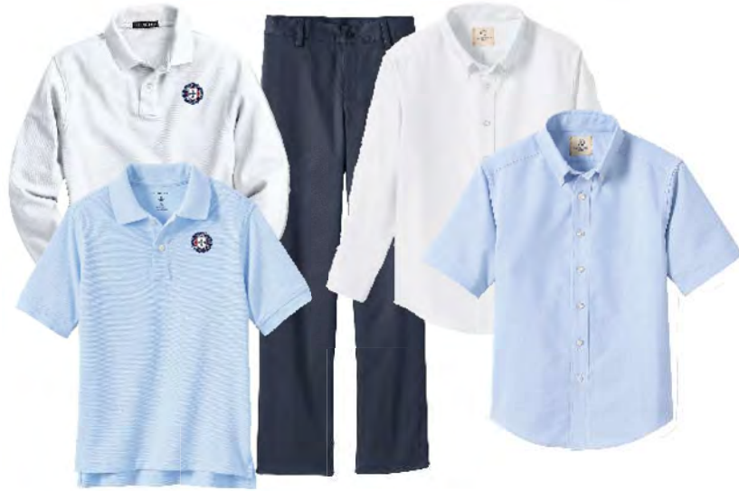
Geneva Logo Polo Short or Long Sleeve White or Light Blue Allowed Monday/Friday