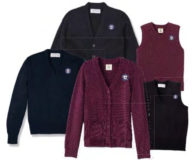
Burgundy or Navy Cardigan, Sweater, or Vest with Geneva Logo May be worn ANY day & may be worn in Classroom for warmth