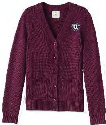
Burgundy Cardigan, Sweater, or Vest with Geneva Logo