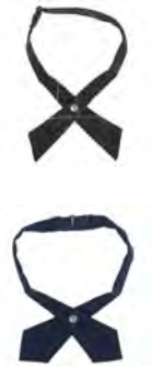
{Optional} Cross Tie Navy or Green Plaid from school office only