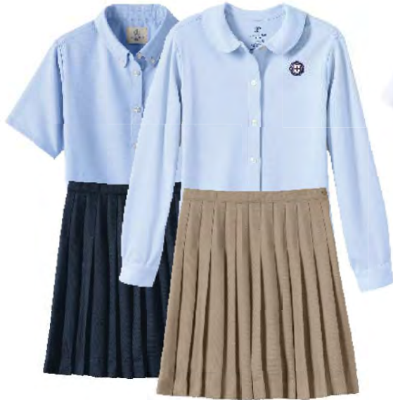
Polo with Geneva Logo -or- Short or Long Sleeve Blouse White or Light Blue