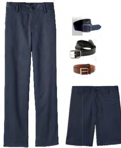
Navy Pants or Shorts with Black, Brown or Navy Belt