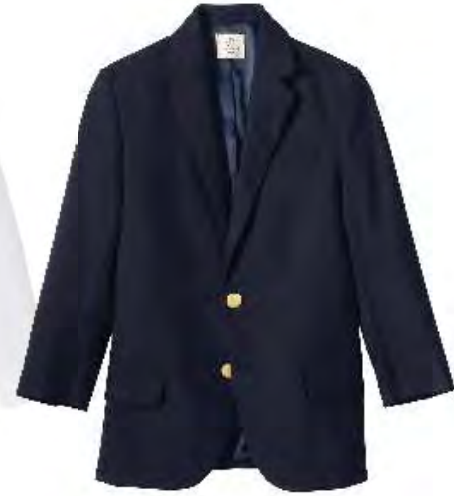
Navy Hopsack Blazer Flynn O'Hara or French Toast Req'd for 11th-12th Optional for 7th-10th