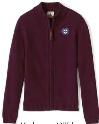
May be worn ANY day Burgundy Cardigan, Sweater, or Vest with Geneva Logo