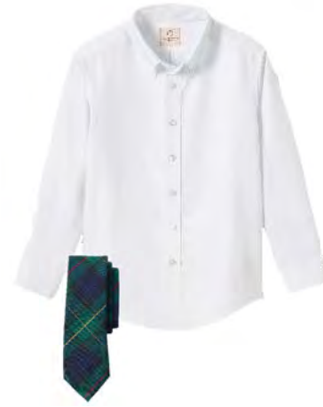
Req'd for Chapel Dress & Special Events