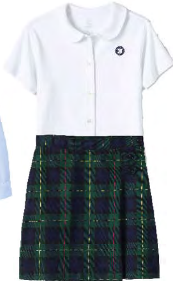
Khaki, Navy or Hunter Plaid Skirt White or Light Blue Blouse or Polo with Logo Short or Long Sleeve