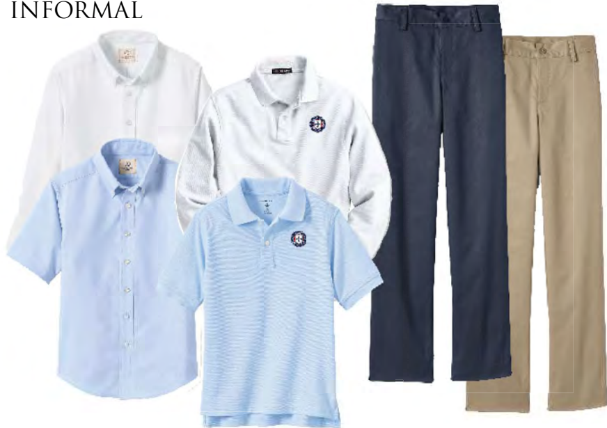
Polo with Geneva Logo or Oxford Shirt Short or Long Sleeve White or Light Blue