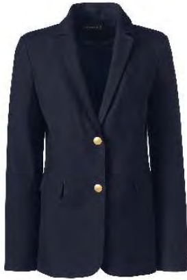
Navy Blazer Flynn O'Hara or French Toast Req'd for 11th-12th Optional for 7th-10th May be worn ANY day & may be worn in Classroom for warmth