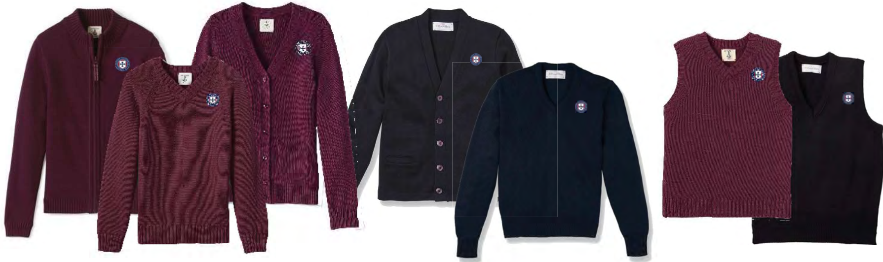
Your choice of Burgundy or Navy Cardigan, Sweater, or Vest with Geneva Logo Available from Flynn O'Hara or French Toast

Your choice of the above may be worn any day & may be worn in Classroom for warmth