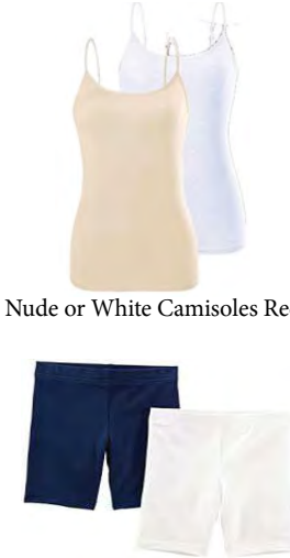
Nude or White Camisoles Req'd

Please read Section II in its entirety. YOUNG LADIES' PROPER FIT FOR ATTIRE -Skirts are to be worn at hips, not natural waist -Hemlines start at mid-knee length & should not be more than 3" above the knee cap when seated. -Nude or White Camisoles are Required under Blouses