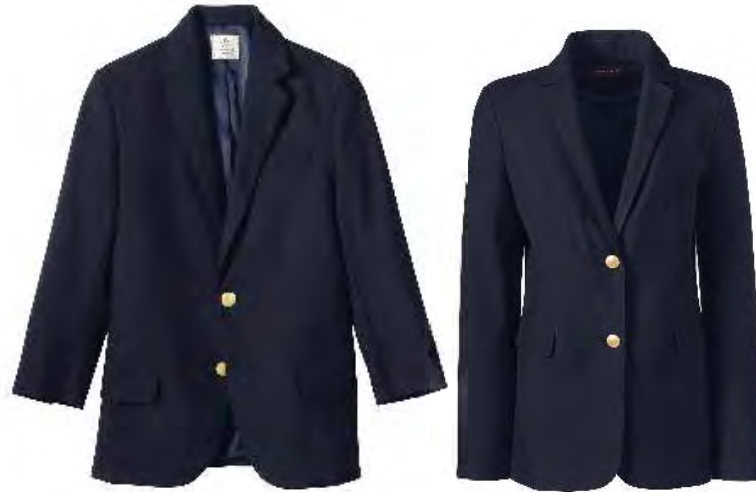
Navy Hopsack Blazer Flynn O'Hara or French Toast

Your choice of the above may be worn any day & may be worn in Classroom for warmth