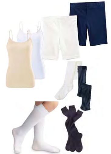
Long Bike Shorts Anklets {K-4 only} Knee Highs or Tights Navy or White No leggings. Nude or White Camisoles Req'd for 4th-6th