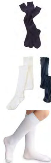
Knee Highs or Tights Navy or White {no exceptions}

Please read Section II in its entirety. YOUNG LADIES' PROPER FIT FOR ATTIRE -Skirts are to be worn at hips, not natural waist -Hemlines start at mid-knee length & should not be more than 3" above the knee cap when seated. -Nude or White Camisoles are Required under Blouses