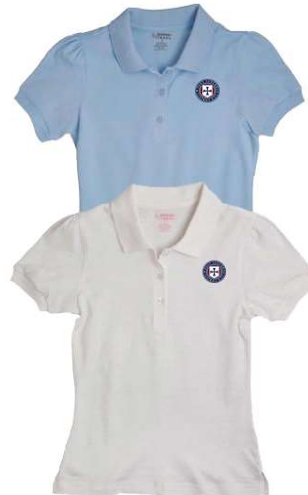
Polo with Geneva Logo White or Light Blue