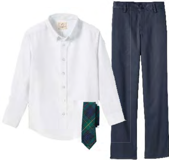
White Long Sleeve Oxford Shirt with Hunter Plaid Tie from French Toast or Flynn O'Hara Navy Pants WITHOUT Blazer