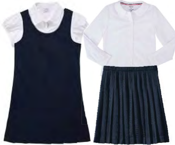
Navy Jumper* * Hemlines must reach the middle of the knee cap (patella) in every season. Tailor or size up accordingly. Navy Skirt* (to be worn at hips, not natural waist) 4th/5th/6th ONLY If worn with Polo, Geneva Logo req'd