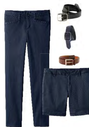
Navy Pants or Bermuda Shorts Black, Navy, Brown Belt