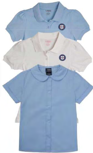
Polo or Blouse Short or Long Sleeve Plain Collar White or Light Blue; White Blouse req'd on Wednesday & Special Events