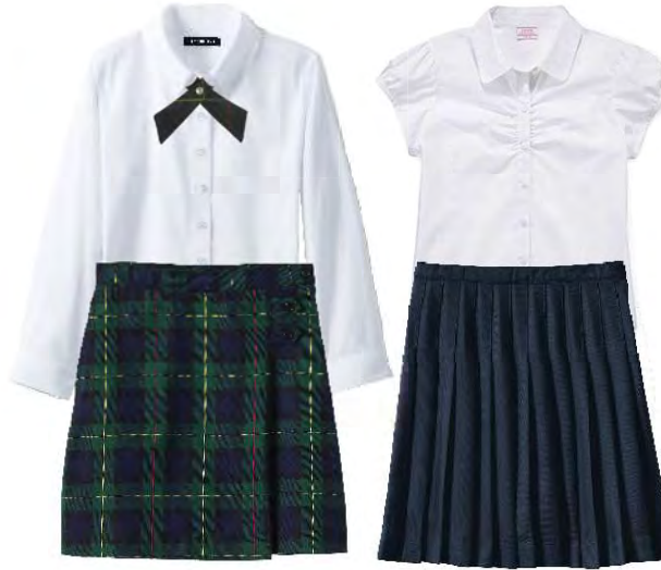
Navy or Hunter Plaid Skirt Short or Long Sleeve White Blouse Req'd with White Knee High Socks or Tights