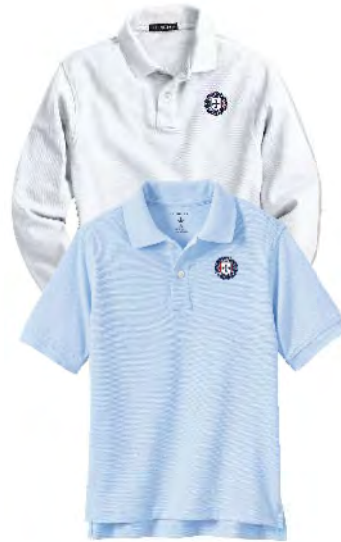
Polo with Geneva Logo Short or Long Sleeve White or Light Blue