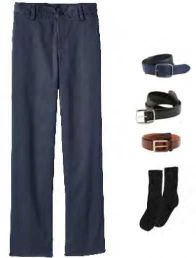
Navy Pants with Black, Brown or Navy Belt