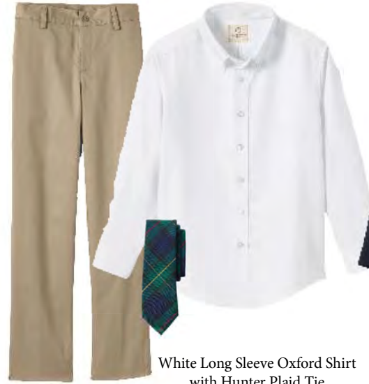
White Long Sleeve Oxford Shirt with Hunter Plaid Tie from French Toast or Flynn O'Hara Khaki Pants may be worn ONLY WITH Navy Blazer

Hunter Plaid Bow Ties are allowed for 11th/12th Grade Boys Optional