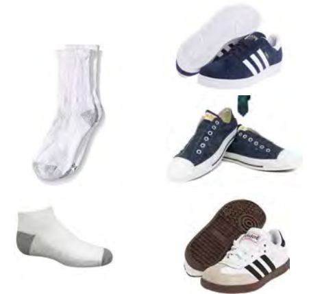
White Socks Plain Athletic Shoes {Minimal neon colors, no lights etc.}