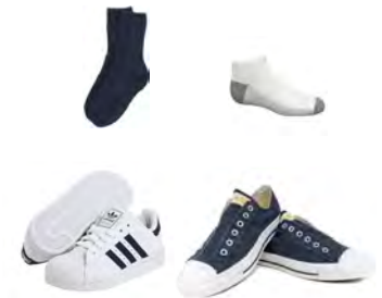
White or Navy Socks Plain Athletic Shoes {Minimal neon colors, no lights or glitter/gems, etc.}