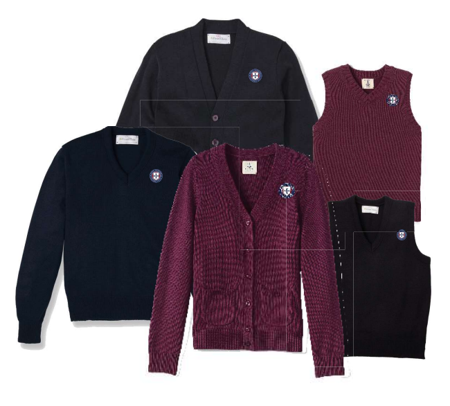
Burgundy or Navy Cardigan, Sweater, or Vest with Geneva Logo

May be worn ANY day & may be worn in Classroom for warmth