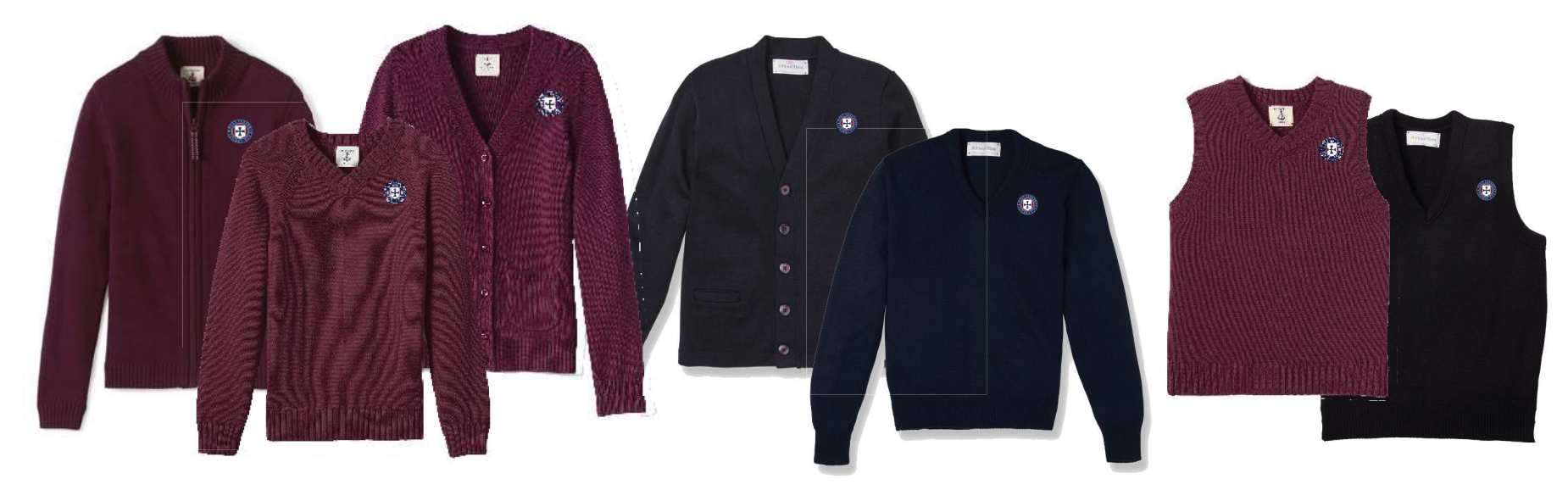
Your choice of Burgundy or Navy Cardigan, Sweater, or Vest with Geneva Logo Available from Flynn O'Hara or French Toast Your choice of the above may be worn any day & may be worn in Classroom for warmth