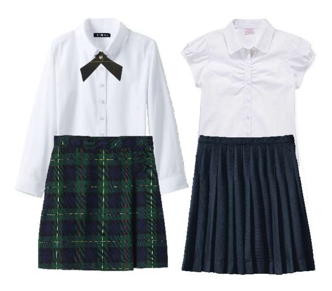
Navy or Hunter Plaid Skirt Short or Long Sleeve White Blouse Req'd with White Knee High Socks or Tights