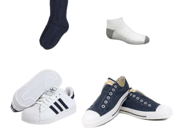
White or Navy Socks Plain Athletic Shoes {Minimal neon colors, no lights or glitter/gems, etc.}