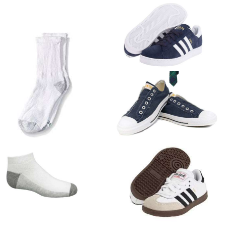
White Socks Plain Athletic Shoes {Minimal neon colors, no lights etc.}