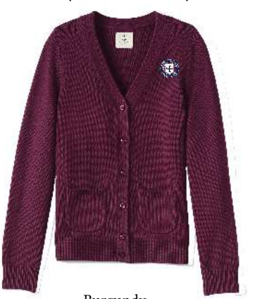
Burgundy Cardigan, Sweater, or Vest with Geneva Logo