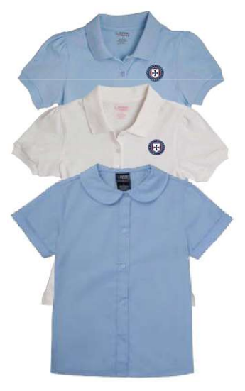
Polo or Blouse Short or Long Sleeve Plain Collar White or Light Blue; White Blouse req'd on Wednesday & Special Events