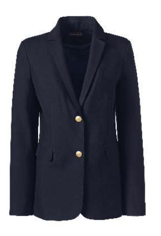
Navy Blazer Flynn O'Hara or French Toast Reg'd for 11th-12th Optional for 7th-10th May be worn ANY day & may be worn in Classroom for warmth