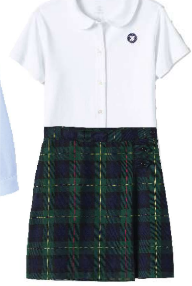
Khaki, Navy or Hunter Plaid Skirt White or Light Blue Blouse or Polo with Logo Short or Long Sleeve