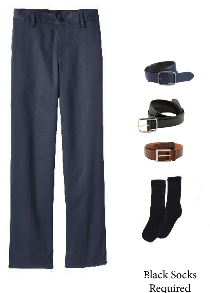
Navy Pants with Black, Brown or Navy Belt