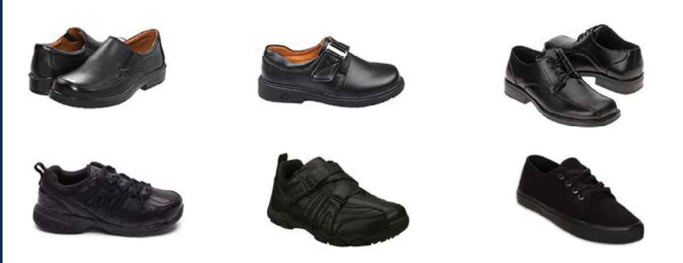
Black Dress Shoes or Solid-Black Canvas or Leather Shoes with or without black laces are allowed. Black shoes with black soles are allowed.