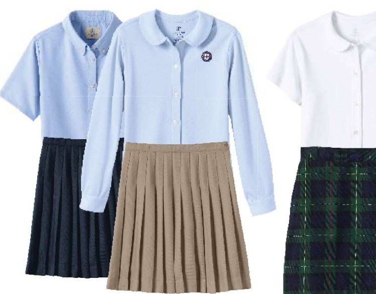
Polo with Geneva Logo -or-Short or Long Sleeve Blouse White or Light Blue