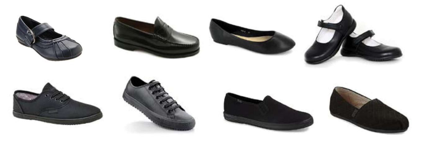
Navy or Black Dress Shoes Mary Jane, T-Strap, Ballet Flats, Loafers not more than 1" heel, no open toe

Solid-Black Canvas or Leather Shoes with or without black laces are allowed.