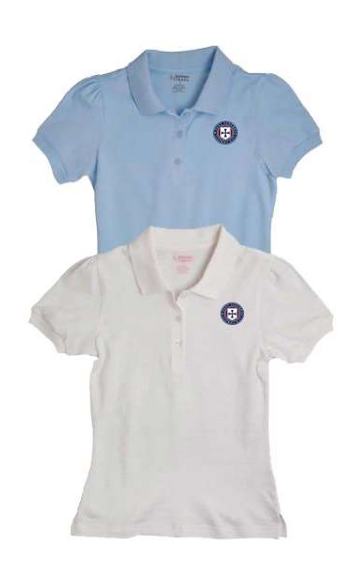
Polo with Geneva Logo White or Light Blue