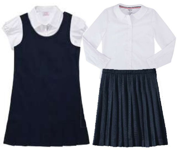
* Hemlines must reach the middle of the knee cap (patella) in every season. Tailor or size up accordingly.