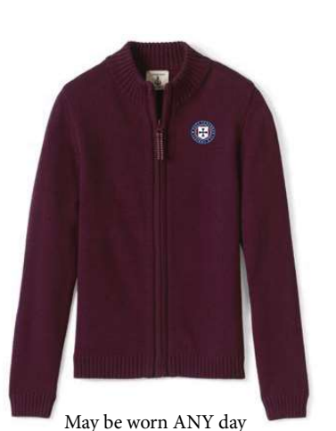
Burgundy Cardigan, Sweater, or Vest with Geneva Logo