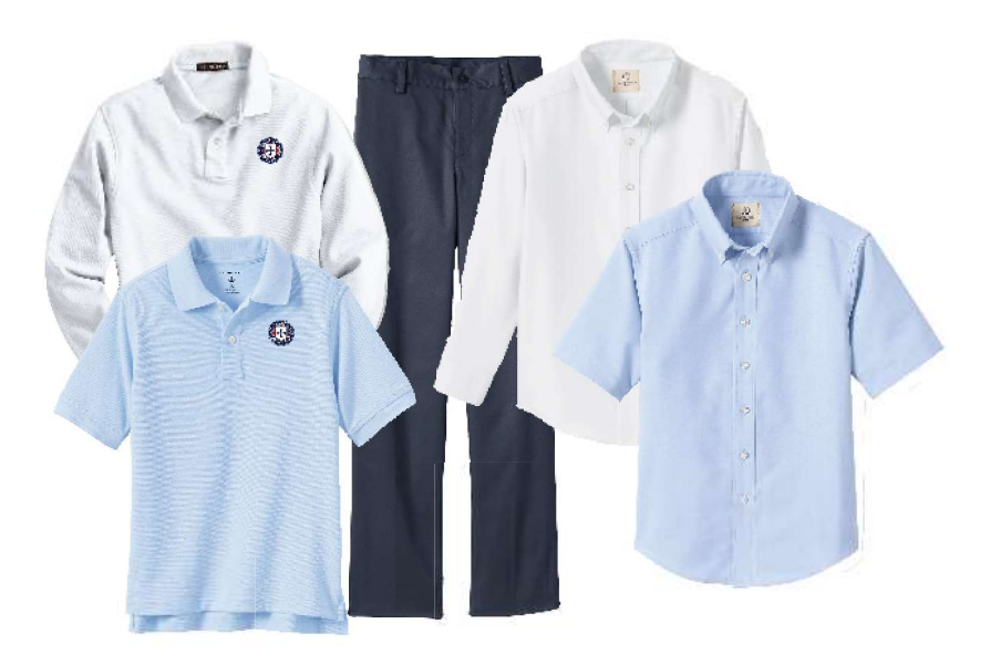
Geneva Logo Polo Short or Long Sleeve White or Light Blue Allowed Monday/Friday