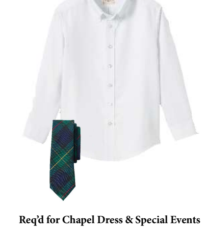
White Long Sleeve Oxford Shirt with Hunter Plaid Tie from French Toast or Flynn O'Hara