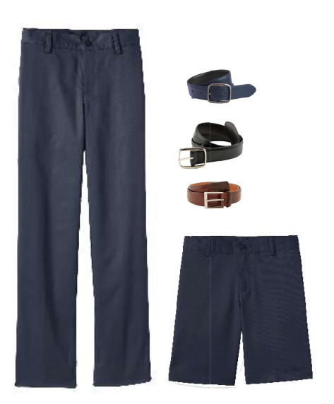
Navy Pants or Shorts with Black, Brown or Navy Belt