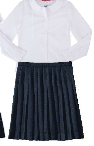
(to be worn at hips, not natural waist) 4th/5th/6th ONLY If worn with Polo,