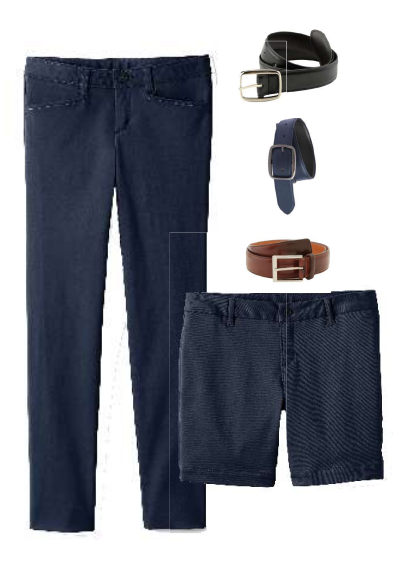
Navy Pants or Bermuda Shorts Black, Navy, Brown Belt