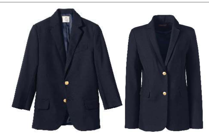
Navy Hopsack Blazer Flynn O'Hara or French Toast Req'd for 11th-12th; Optional for 7th-10th May be worn any day & may be worn in Classroom for warmth