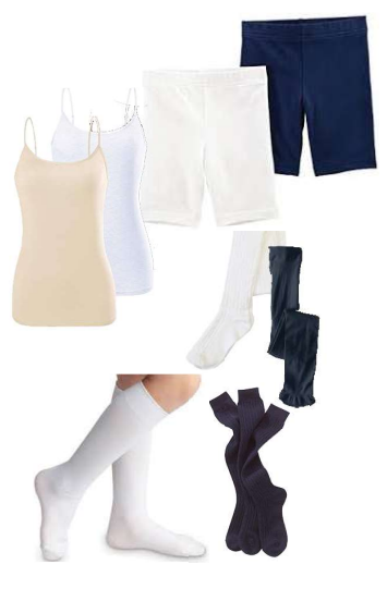
Long Bike Shorts Anklets {K-4 only} Knee Highs or Tights Navy or White No leggings. Nude or White Camisoles Req'd for 4th-6th